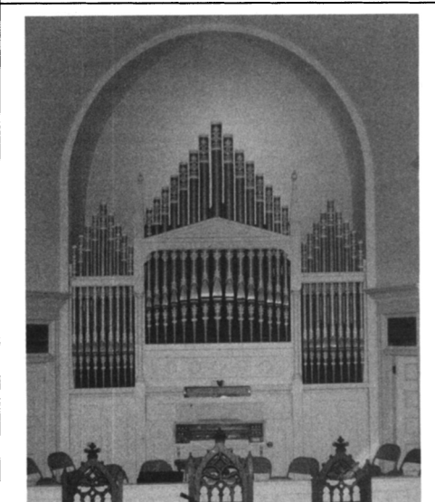
First United Methodist Church Elberton, Georgia