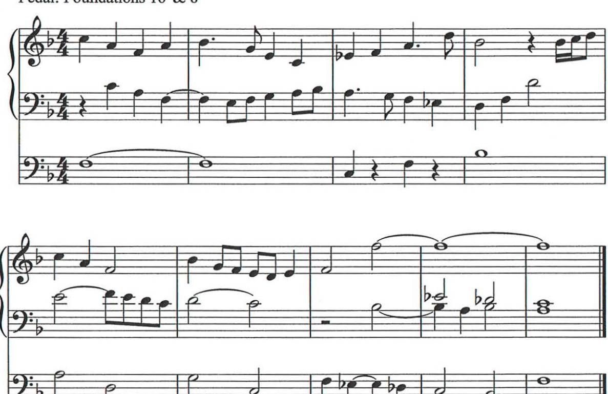
Manual: Foundations 8' & 4' Pedal: Foundations 16' & 8'