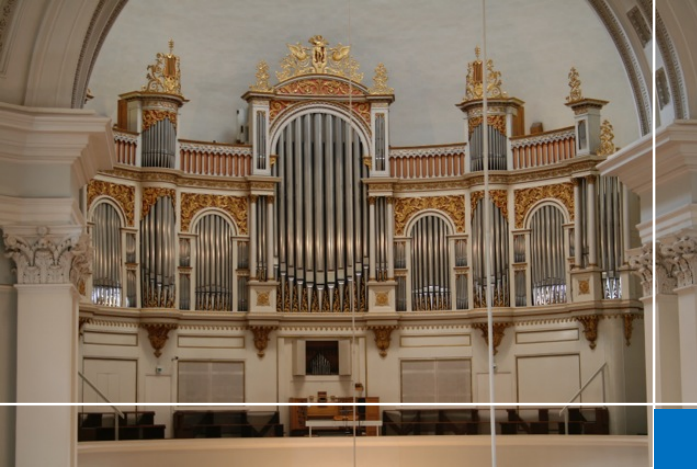
Marcussen & Søn organ (IV/84 ranks) at Helsinki Cathedral