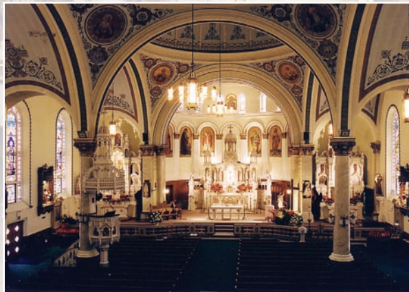
The noble majesty of the nave and high altar