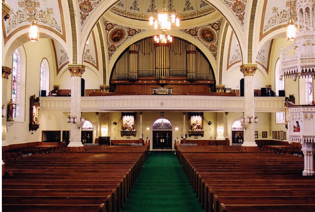
A façade designed to be proportional to the scale of the room.