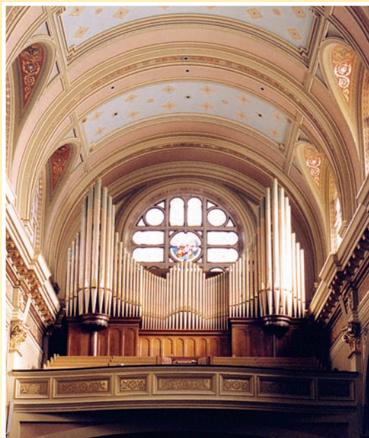
The 1920 W.W. Kimball in the rear balcony.