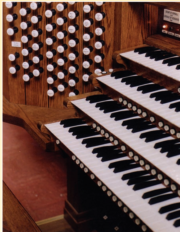
Left: One of the two round corbels in the façade. Right: the new console by Berghaus.