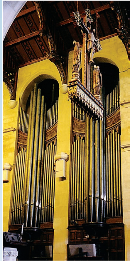
Above: a well-known, and well-loved E.M. Skinner façade. Below: the now restored Skinner organ.