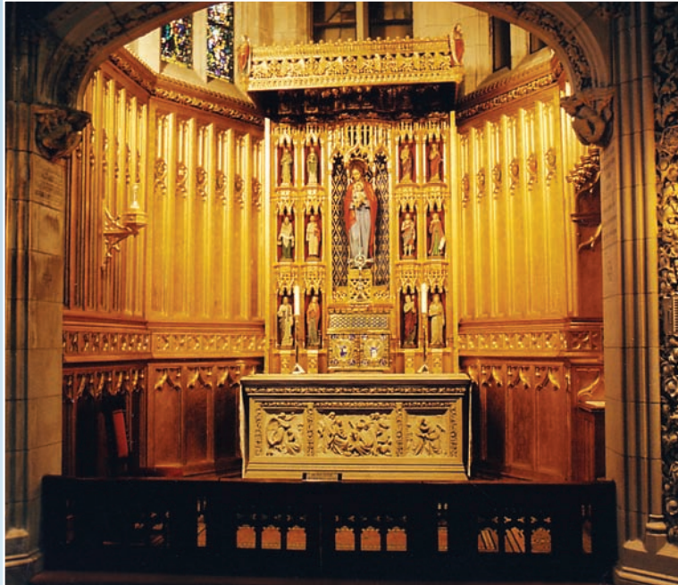
The gilded Lady Chapel