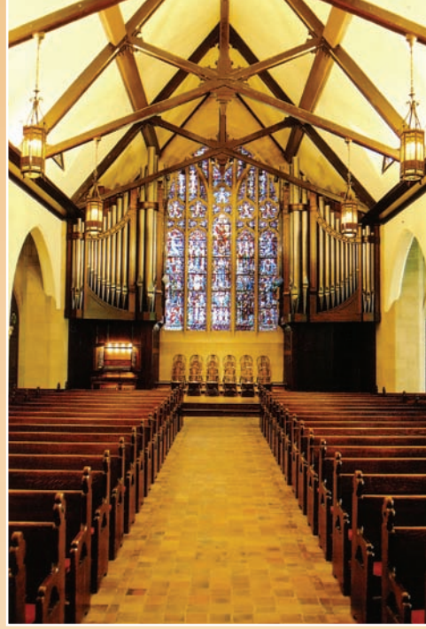
The sanctuary of St. Chrysostom Episcopal Church with a view of the liturgical west window flanked by C.B. Fisk Opus 123.