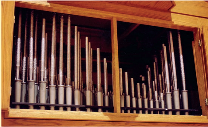
The positif division.