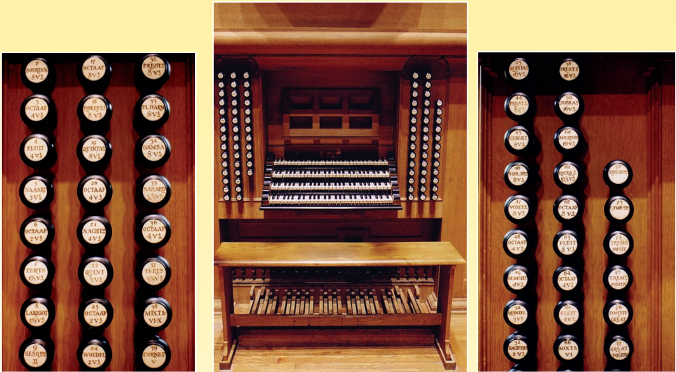
The keydesk of the 1989 Flentrop with details of the left and right jambs. The Flentrop organ commands a strong profile and sings down the axis of the Nave.