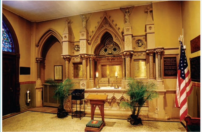
Left: beautifully-styled Victorian-era stenciling surrounds a stained glass window. Pictured above: the chapel, which survived the Chicago fire, features a tablet memorializing a visit by Abraham Lincoln.