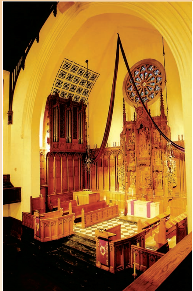
A sublime choir and chancel area.