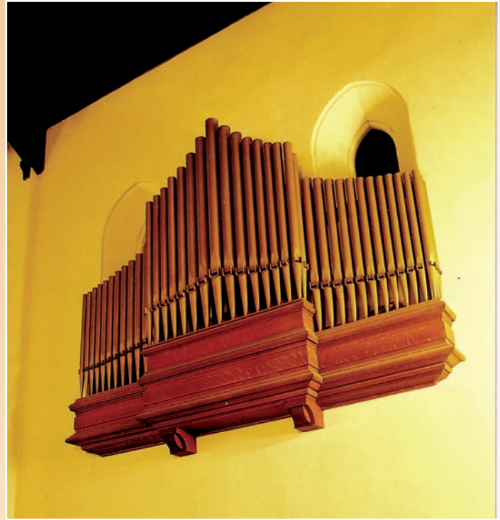
The antiphonal division façade.