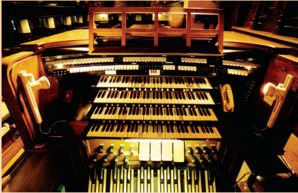
The Austin console.

8 English Tuba (unenclosed—recent addition) Choir to Choir 16 Choir Unison Off Choir to Choir 4 Swell to Choir 16 Swell to Choir 8 Swell to Choir 4